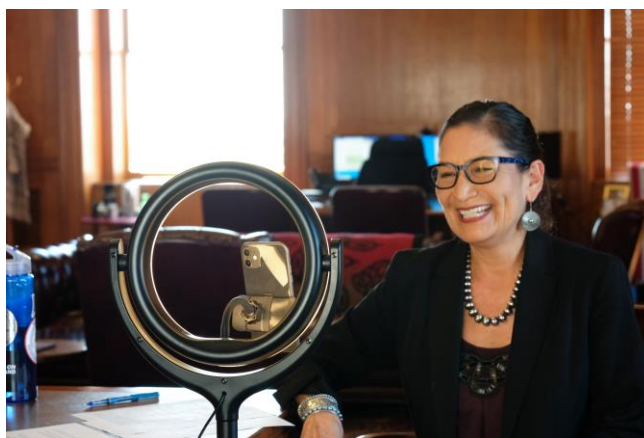
U.S. Secretary of Interior Deb Haaland

Knowing that the actions taken by the United States government in boarding schools amounts to genocide of Native Americans under both federal and international law, the next logical question is this: where do we go from here? The Interior Secretary has already started with the most obvious in creating The Federal Indian Boarding School Initiative to investigate the conditions of abuse and deaths in the schools. To expect the full picture to emerge from this may be naïve, though. Canada took a similar approach with their Truth and Reconciliation Commission (TRC), eventually publishing a final report in 2015. 132 However, throughout 2021, hundreds of unmarked graves were found across multiple Canadian boarding schools, 133 suggesting the TRC report was not a definitive picture of boarding schools. Hopefully, the United States will take these findings into account in determining the scope and focus of their investigation. Given that the United States government has been notoriously evasive about boarding schools, 134 it seems reasonable to recognize the magnitude of this investigation while remaining skeptical about the transparency of the findings.