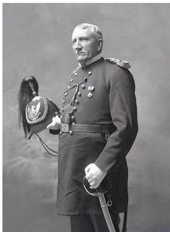
Richard Henry Pratt, Founder of Carlisle Indian School

The first United States boarding school, located on the Yakima Indian Reservation in Washington state, was established in 1860. 19 On-reservation schools like this were met with less opposition from Native parents than off-reservation schools. 20 Both the U.S. government and churches undertook the operation of the schools. 21 22 In 1879, the first federally run, off-reservation boarding school, the Carlisle Industrial Indian School, was established in an effort to further remove Native children from tribal life and influence. 23 24 The Carlisle School was founded by Army officer Richard Pratt. 25 Pratt, who was an advocate for “Americanization” and assimilation, famously coined the phrase “kill the Indian and save the man.” 26 The school became a national model based on Pratt’s philosophy. 27