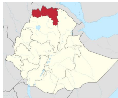
Tigray Region in Ethiopia

Since the beginning of the conflict, there have been many violations of international human rights laws by the Ethiopian authorities. An investigation by the United Nations Office of the High Commissioner for Human Rights and the state-appointed Ethiopian Human Rights Commission have documented mass killings of civilians. These abuses include “extrajudicial killings and extrajudicial executions, widespread sexual violence, torture, forced displacement, arbitrary detentions, violations of economic, social, and cultural rights, and denial of access to aid.” 15 Since June 2021, Ethiopian authorities have denied Tigrayans access to life-saving aid and services. 16