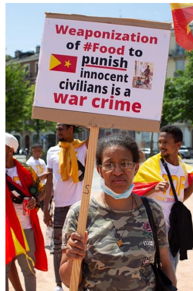
in Tigray, September 2021