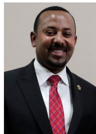
Ethiopian Prime Minister Abiy Ahmed

A mass demonstration in support of Abiy Ahmed's government was held on November 7, 2021. Tens of thousands of Ethiopians went to the capital city, Addis Ababa, to show support for the government and for continuing the war. The demonstrators rejected international demands for the Ethiopian government to start negotiations with the TPLF. 64 Many Ethiopian supporters have referred to the TPLF as terrorists and have asserted that the government should not negotiate with terrorists. 65 Those who support the government do not want TPLF to rule the country again. The TPLF released a statement claiming that its military is heading to Addis Ababa to capture the capital city. However, the TPLF would have to get through the Amhara region to reach Addis and is likely to face resistance in the Amhara region from people who fear TPLF's return to power. 66