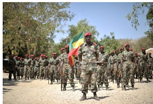
Ethiopian National Defense Forces

An election to select a new Prime Minister was scheduled for August 2020. However, the National Electoral Board of Ethiopia announced in March 2020 that the election would be canceled due to the COVID-19 pandemic. 4 The elections were rescheduled to be held within 9-12 months after health officials could confirm that COVID-19 would no longer endanger the health of the public. 5