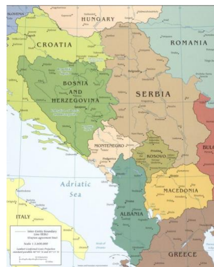
Balkans Regional Map

The ICJ found that the court had jurisdiction over the case, as both states were party to the Genocide Convention. Neither state had opted out of Article IX of the Convention which states that "disputes between the contracting parties relating to the interpretation, application, or fulfilment of the present Convention, shall be submitted to the International Court of Justice at the request of any of the parties to the dispute." 10 It thus fell upon the court to determine two points: (1) Do the alleged events constitute genocide as codified in the Convention, and if so, (2) to what extent is Serbia responsible for genocidal acts perpetrated against Bosnian populations?