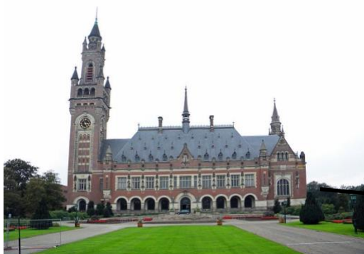
The Peace Palace