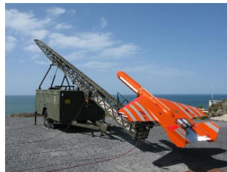
SCRABB II Target Drone

Whether in response to drone warfare, increasing non-state combatants, or the continuing evolution of techniques of warfare, IHL supporters will continue to develop the law to protect noncombatants and to minimize the suffering resulting from warfare.