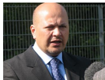
Karim Asad Ahmad Khan

Currently there are 137 signatories, but only 123 states are considered parties to the treaty (meaning the ICC has official jurisdiction within them as a State Party). As of winter 2021, the United States is not a State Party. 139 The State Parties fund the ICC by making annual contributions, along with having the option to make donations for special funds. All State Parties are members of the Assembly of States Parties, which meets annually to approve the ICC budget and elect the judges and the chief prosecutor. 140 The current ICC Prosecutor is Karim Asad Ahmad Khan, whose term began in 2021 and concludes in 2030. 141