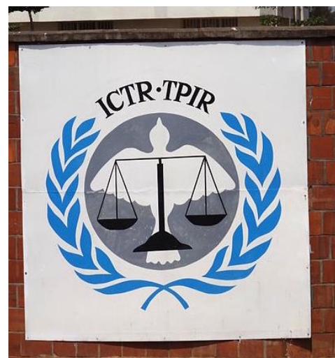
Banner for the ICTR in Kigali

For more information about ICTR proceedings and prosecutions, see the ICTR website. 177