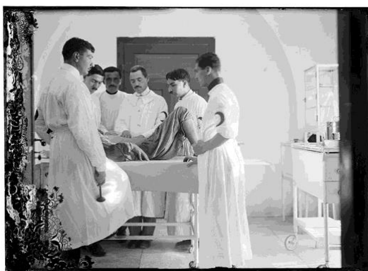
The Ottoman Red Crescent in Jerusalem