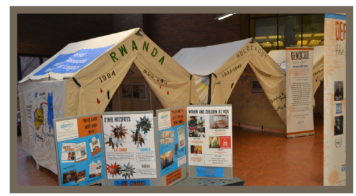
At the University of Minnesota

Rental fees for Minnesota venues are waived through generous donors. Out-of-state rental fees are arranged on an individual basis.