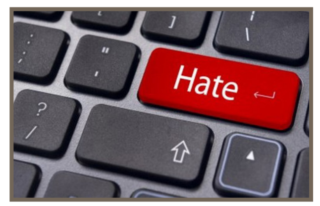
Stormfront, American Renaissance, Aryan Guard, and VCARE are other hate sites that are up and prospering, reaching hundreds of thousands every day.

Hate websites are often hosted by prominent domain organizations, despite Silicon Valley's promises of strict regulation of their sites. Daily Stormer is one of the most popular white supremacist websites, modeled after the Nazi-era publication Der Sturmer . After the deadly August rally in Charlottesville, GoDaddy, Google, and other domain registrars refused to host Daily Stormer , but eventually it found a new home on the dark web, a web area not indexed by standard search engines.