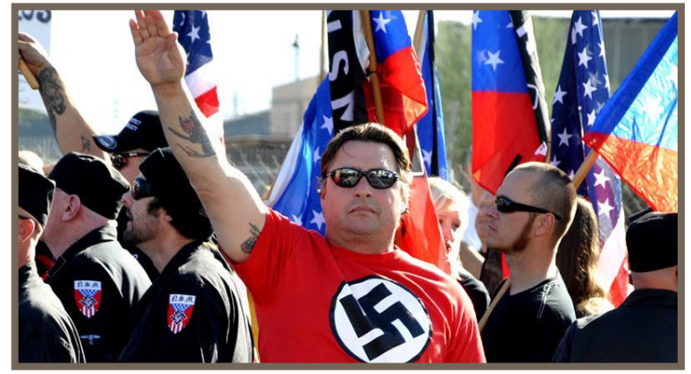
Neo-Nazi rally in the US

The number of hate groups in the country has increased to nearly a thousand, according to the Southern Poverty Law Center. These groups are dominated by Neo-Nazis, anti-Muslims, KKK supporters, neo-Confederates, and white nationalists. Their goal is to spread fear and to encourage discriminatory laws and procedures that violate the human rights of the people they demonize, to marginalize and disenfranchise them.