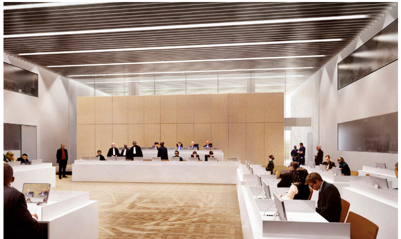
Rendering of the future courtroom of the ICC permanent premises. © Schmidt Hammer Lassen Architects

The timeline for the completion of the premises, September 2015, remains on schedule, with the permanent premises expected to be ready for occupation by the Court in December 2015