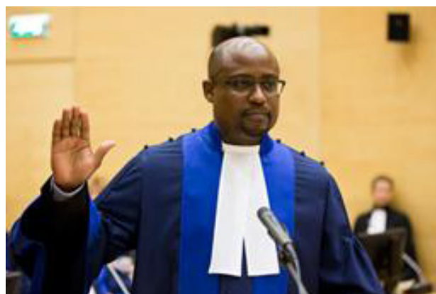
Judge Henderson during the swearing in ceremony on 12 December 2014.