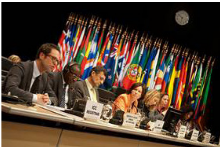
Panel during the plenary session on cooperation

THE COOPERATION resolution from the 11th session of the ASP requested the Bureau to establish another facilitation on cooperation for the duration of 2013, following which, the Bureau re-appointed Ambassador Anniken Ramberg Krutnes (Norway) as cooperation facilitator. Over the course of 2013, The Hague Working Group prioritized the following: a review of the 66 recommendations on cooperation; non-essential contacts with persons subject to an arrest warrant; privileges and immunities of ICC staff; and arrest strategies. In a similar vein as the workshop on cooperation held last year, the facilitator organized a one-day meeting in May as the centerpiece of the ASP's inter-sessional work on cooperation, bringing together ICC and state party officials, NGO representatives and external experts, including from the United Nations Office of Legal Affairs and Interpol to discuss the issue of non-essential contacts, privileges and immunities and arrest strategies. The facilitator also organized two forums on witness protection in Dakar and Arusha.