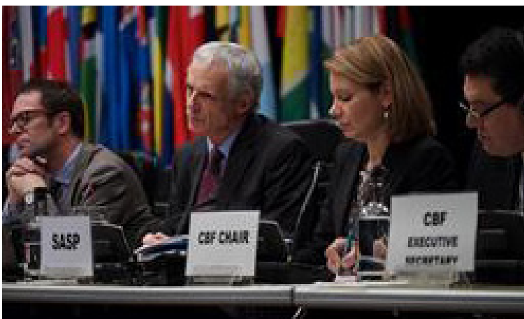
Working Group on ICC Budget.

THIS YEAR THE Court submitted to the ASP a budget proposal for 2014 of €126.07 million, based on estimates of what its financial resource needs would be for 2014. This proposed budget represented an increase of €10.95 million on the approved budget for 2013 and was mainly due to an increase in the number of situations, the volume of prosecutorial and judicial activities and the corresponding services and implementation of the new OTP strategy, as well as forward commitments and common system costs.