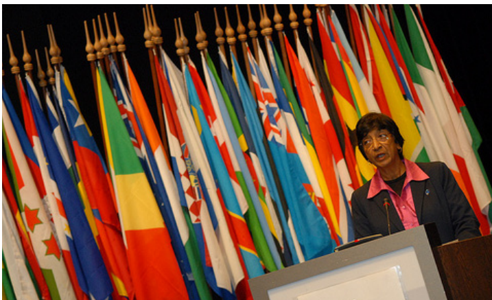
Navi Pillay, UN high commissioner for Human Rights, during the opening of the 12th session