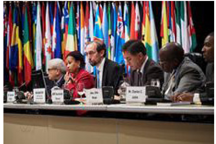
Panelists at the debate on head of state immunity

erlands, Peru, Belgium, Romania, Mexico, South Africa, Japan, Norway, Chile, Russia, Germany, the United Kingdom, Switzerland, New Zealand and Brazil. The states welcomed the inclusion of the Special Segment on the agenda of the ASP. Many States drew attention to the relationship between peace and justice and stated that the quest for justice cannot be allowed to jeopardise peace and security. There was a general consensus that something must be done to address the AU's concerns. However, many States also made interventions in which they said that the integrity of the Rome Statute cannot be compromised, that the independence of the Court as a judicial institution is paramount, and that Article 27 of the Rome Statute is an untouchable cornerstone of the ICC system. States picked up on the comments of the panellists and reiterated that there is a need to find practical solutions to the problems facing the Court, while others suggested that these solutions may already exist within the Statute and Rules of Procedure and Evidence. There was also general recognition that the Special Segment was just the beginning of what will be an ongoing dialogue between the states parties over the coming year.